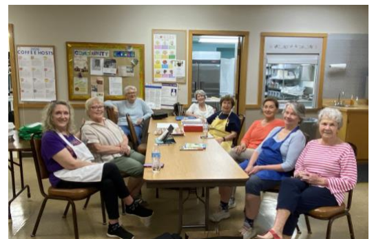
A rare opportunity to photo the "Greenhorns" all together in one place.