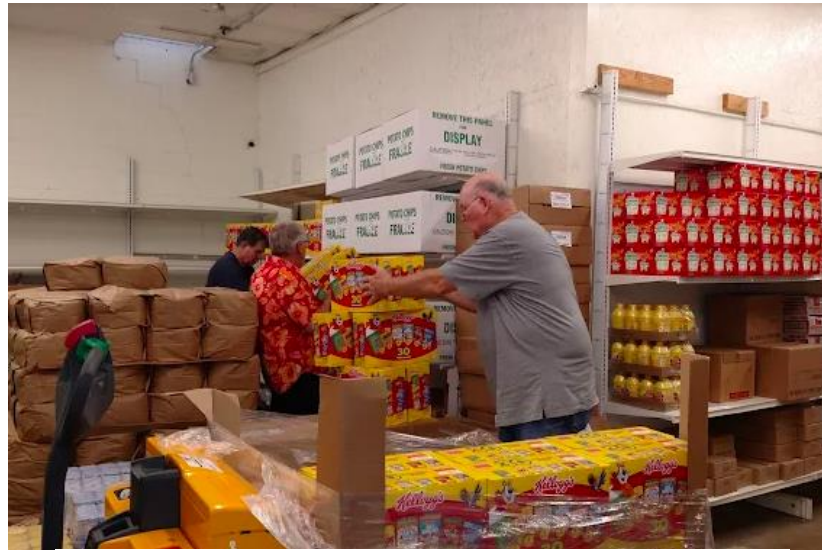
Volunteers at Project HOPE Food Bank sort and stack bulk food purchases.

The Project HOPE Food Bank, located in Hot Springs, distributes food in Clark, Garland, Grant, Hot Spring, Montgomery, Ouachita, Pike, Saline and Union counties in Arkansas. The food bank opened in 2009 and operates under the direction of a volunteer Executive Director and an advisory board of directors. Through the support of community organizations, Project HOPE Food Bank (PHFB) distributes about 1 million pounds of food annually through 50 agencies and approximately 60,000 pantry visits. The PHFB also sponsors roughly 25,000 school backpacks, healthy after school snacks, and serves about 352,000 meals annually through charity kitchen partners.